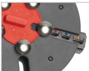
Round magazine with quick change system