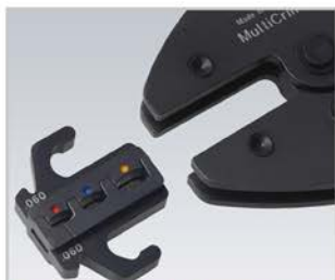
Secure attachment of the dies in the pliers by reliable locking system