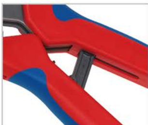
Catch for exchange of crimping dies