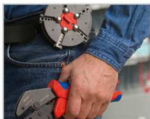
Round magazine with belt clip makes the interchangeable dies conveniently located and ready to use.