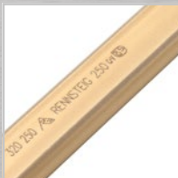
Quality Finish with Laser Marking