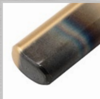
Tempered Safety Striking Head