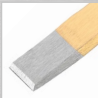
Polished or Laquered Blade, Ground Edge