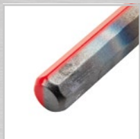
Tempered Safety Head