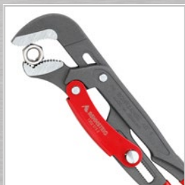
Perfect fitting right at the workpiece