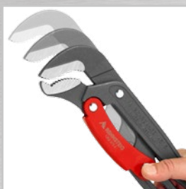
Quick and precise adjustment by pushing a button