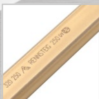
Quality Finish with Laser Marking