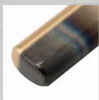
Tempered Safety Striking Head