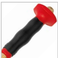
Two-Component Hand Guard