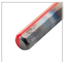
Tempered Safety Head