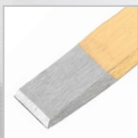
Polished Blade, Ground Edge